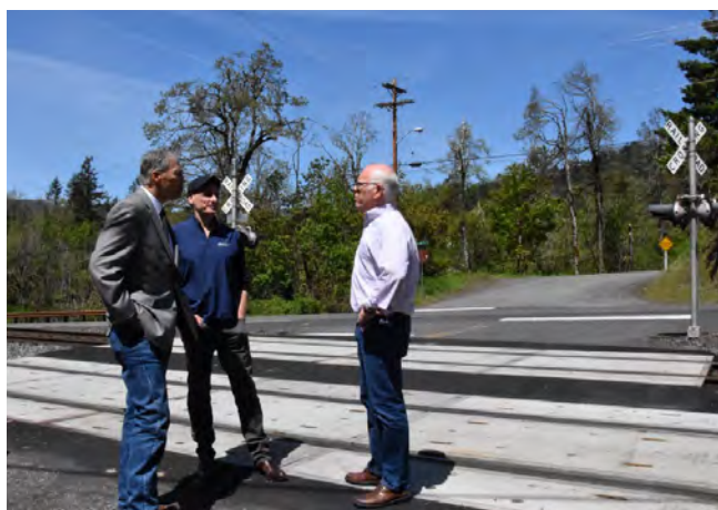
Washington Governor Jay Inslee, left, has worked to hold oil-by-rail infrastructure to high safety and environmental standards. 132 In 2018, he rejected a permit for what would have been America's largest oil-by-rail terminal, citing risks to the environment and public health. 133

The avenues by which governors can limit new fossil fuel infrastructure vary by state and circumstance. In Washington, Governor Jay Inslee rejected a construction permit for an oil-by-rail terminal. 128 In California, to prevent offshore drilling in federal waters outside of state jurisdiction, the California State Lands Commission announced that it would refuse to approve new pipelines or the use of existing pipelines to transport oil produced by Pacific offshore drilling. 129 In New York state, Governor David Paterson issued an executive order in 2010 placing a moratorium on the issuance of permits for hydraulic fracturing. 130 And in Pennsylvania, Governor Tom Wolf issued an executive order reinstating a moratorium on new leases for oil and gas development in state parks and forests. 131