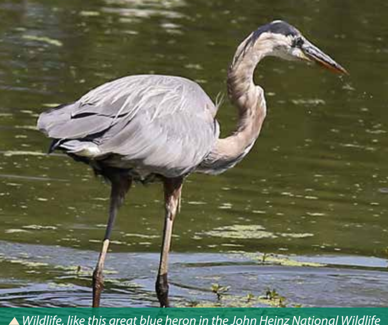
Wildlife, like this great blue heron in the John Heinz National Wildlife Refuge, can be harmed or even killed by plastic waste they mistake for food.

Nothing we use for a few minutes should be allowed to pollute our communities, rivers, streams and oceans for centuries. That's why PennEnvironment launched a new campaign to tackle the problem of plastic waste.