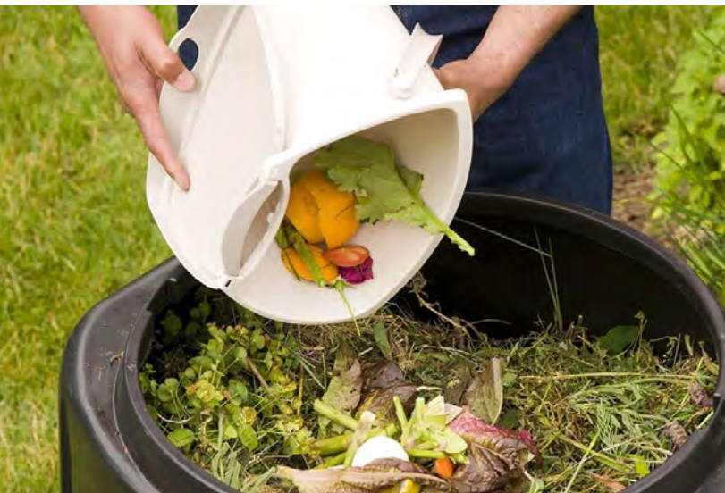
Composting keeps food waste and yard trimmings out of landfills and combats climate change, but local governments often need to invest in infrastructure to get composting programs off the ground.

Recyclable materials are only part of the nation’s waste stream. Compostable materials such as food waste and yard trimmings make up nearly 30 percent of all U.S. garbage, while only 9 percent of all U.S. waste is actually composted. 78 Access to composting services is also inadequate, with a limited number of communities offering curbside composting programs in urban areas where backyard composting is often unrealistic. In 2015, only about 200 communities in the United States offered a curbside composting program. 79 That same year, over 50 million tons of compostable waste ended up in landfills or incinerators. 80