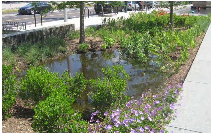
Rain gardens – planted areas that absorb rainwater where it falls – filter rainwater and add green spaces to developed areas.

Funding green infrastructure projects can help avoid aging sewer systems from being overwhelmed during heavy rainfalls and causing dangerous overflows onto public streets and into waterways. In addition, ensuring federal funding for transportation does not encourage the widening or expansion of highways and impermeable surfaces will help curb runoff pollution from impacting our rivers and streams.