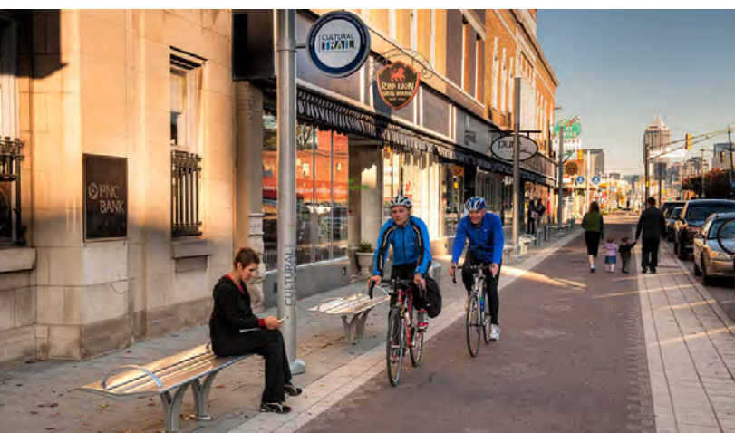
Investments in bicycling and pedestrian facilities, such as the Indianapolis Cultural Trail (above), can encourage low-carbon forms of travel and make cities and towns more pleasant places to live.

Other policies the federal government should pursue include lifting limitations and hurdles to the conversion of street space to transit or bicycle lanes, and required adoption of complete street policies as a condition for receiving federal transportation funding.