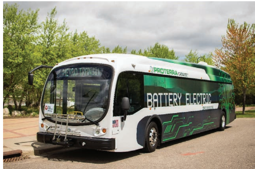
A Minneapolis St. Paul Metro Transit electric bus.