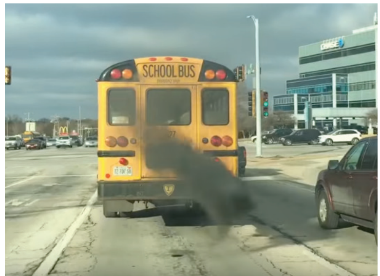
Pollution from a diesel-powered school bus.

Diesel pollution can lead to decreased lung function, respiratory tract inflammation and irritation, and aggravated asthma symptoms. 23 Diesel soot also contains tiny particles of carbon, metal oxides and heavy