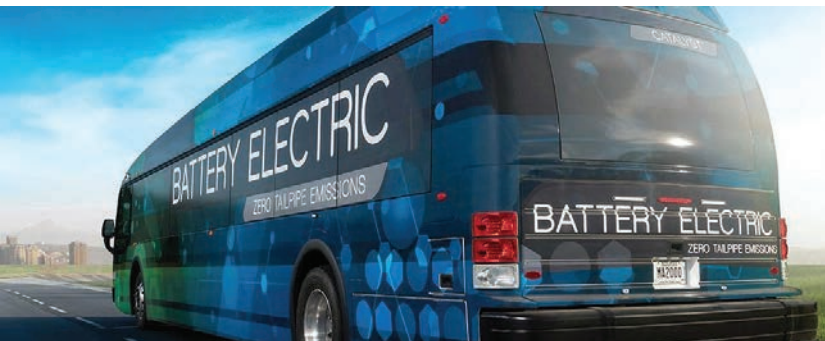
A Proterra Catalyst electric bus.

THE ELECTRIC BUS MARKET in the United States has expanded dramatically over the last five years. There are a total of 528 fully electric, battery-driven buses currently in service across the country – an increase of 29 percent in 2018 alone. 66 Recent pledges by California, New York City and Seattle to transition to zero-emission fleets mean that 33 percent of all transit buses in the U.S. are now committed to go electric by 2045. 67 Roughly 4 percent of all new public transit bus sales in 2018 were electric buses, and 13 percent of the country's transit agencies currently either have electric buses in their fleets or have them on order. 68 Taking into account those that have received grant funding for electric buses but not yet placed orders, upwards of 18 percent of U.S. transit agencies are now making moves toward electric buses. 69 Major players in the market include manufacturers Proterra, BYD Motors and NFI Group, the parent company of New Flyer of America. Companies bringing out electric school bus models include Blue Bird Corporation, Nova Bus Corporation, The Lion Electric Co., Thomas Built