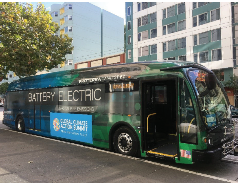
A Proterra electric bus.

Diesel buses also contribute to widespread problems with particulate matter and ozone “smog” pollution across the country. Diesel vehicles produce fine particulates (referred to as PM 2.5 ) as well as volatile organic compounds (VOCs) and nitrogen oxides (which are both precursors of ground-level ozone), among other pollutants. 26 A 2017 study linked exposure to fine particulate matter and ground-level ozone to higher rates of mortality, concluding that exposure to particulate matter and ozone, even at levels below national standards, contributes to adverse health impacts. 27 Ultrafine particulate matter (< 0.1 micron in diameter) is especially dangerous since it can enter deep into lower airways, carrying heavy metals that are now linked to Alzheimer’s disease, along with odorless, toxic chemicals such as polycyclic aromatic hydrocarbons (PAHs) that irritate the respiratory tract. 28