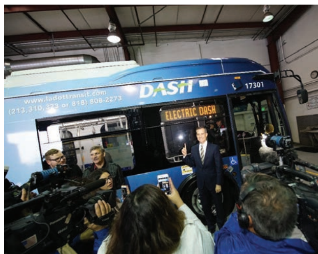
Los Angeles Mayor Eric Garcetti unveils a new 100% electric DASH bus.

California has been at the forefront of moves towards bus electrification. In 2018, the California Air Resources Board approved a statewide rule committing to shift to 100 percent all-electric transit buses by 2040. 71 Large transit agencies in the state will be required to purchase 25 percent electric buses starting in 2023, then 50 percent by 2026, with no new purchases of non-electric buses beginning in 2029. 72 In 2017 the Los Angeles Department of Transportation (LADOT) and Los Angeles County Metropolitan Transportation Authority (LA Metro) committed to full-fleet electrification by 2030. 73 As of 2019, California has 210 electric buses in service and a backlog on order, bringing its total commitment to electric buses to around 450. 74