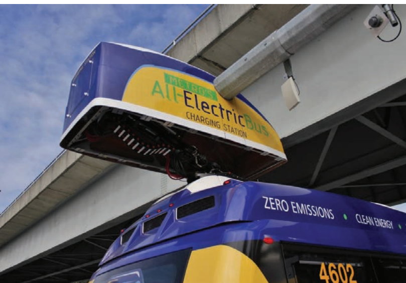
A King County Metro electric bus charging at Eastgate Park & Ride.