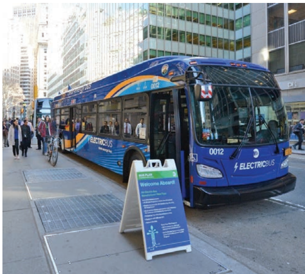
New Flyer electric bus outside MTA Headquarters, New York City, April 2018.