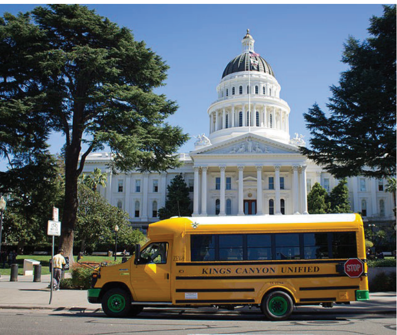
The first all-electric school bus in California, outside the California capitol building in Sacramento in 2014.