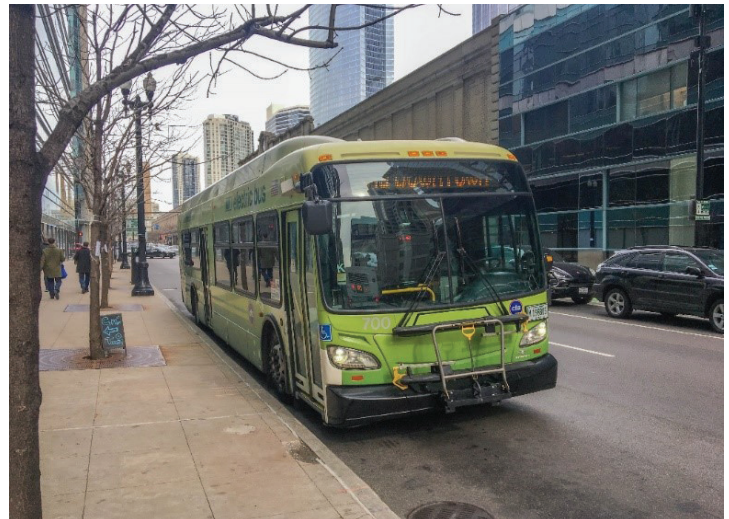
An electric bus in Chicago.

The CTA has committed to converting its entire bus fleet to electricity by 2040, 117 and has claimed that its experience with electric buses has demonstrated that these vehicles are a viable way of building a "greener, healthier and more efficient" transit system. 118