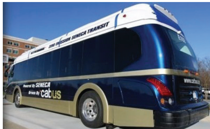
A CAT electric bus.

In 2010, the City of Seneca partnered with CAT, the Center for Transportation and Environment (CTE) and the South Carolina Department of Transportation (SCDOT) to apply for a federal grant from the Low or No Emission Program to develop the first scalable model of an all-electric bus transit system in the U.S. In contrast to other cities, which had to that point only deployed one or two electric buses as “parade buses” in their fleets, Seneca intended from the start to convert the entire operation to all-electric