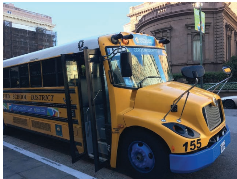
A Twin Rivers USD e-Lion bus.

The rollout of the Trans Tech buses was rockier, Shannon reports. These vehicles are powered by sodium-nickel batteries, which, if they go cold, take two days to warm up to the point where they are functional again. One issue the district encountered was a problem (which the manufacturers now believe they have solved) with the 12 volt battery that keeps the nickel batteries warm. It also emerged that use of the onboard heaters creates a slight drain on the systems, which again, the manufacturers are currently working to address. The district is also working to solve a problem with equipment that manages overnight charging, instead charging the vehicles on-demand for the time being. Energy costs are already low ($0.10 per kW/h), but will be reduced further once the managed charging infrastructure is in place. 171