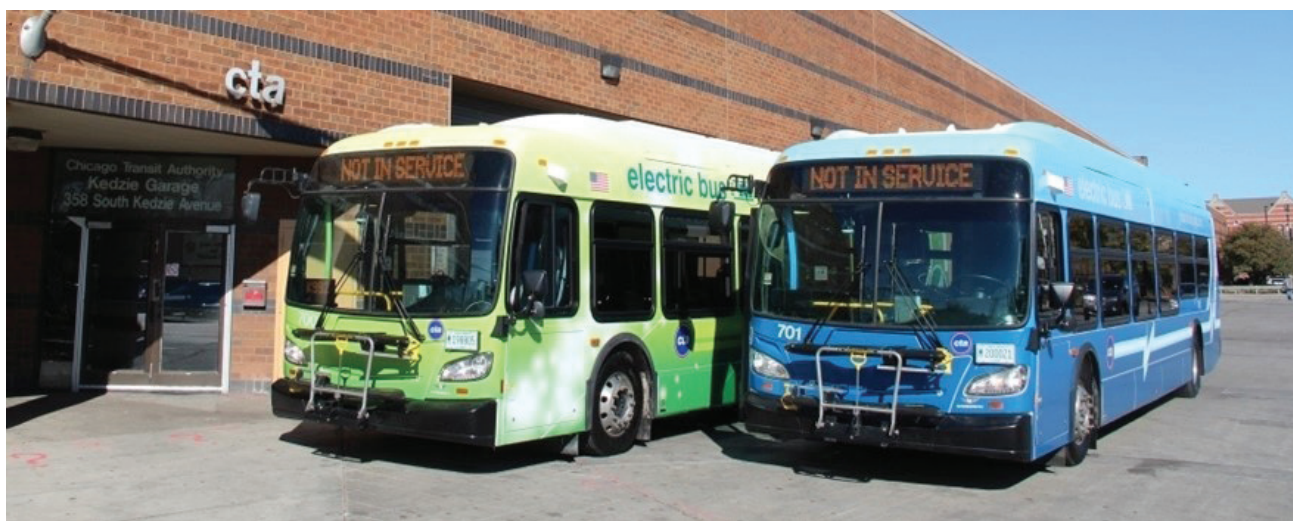
Chicago's first all-electric buses.