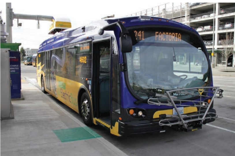
King County Metro electric bus at Eastgate Park & Ride, Bellevue, WA.