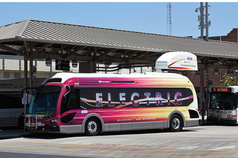
An all-electric Proterra BE35 bus operated by San Joaquin Regional Transit District (RTD), California next to its “Fast Charging” station.

Government funding and other incentives can make electric buses even more affordable. For instance, California's Hybrid and Zero-Emission Truck and Bus Voucher Incentive Project (HVIP) currently offers up to $235,000 for electric school buses sold in the state. 56 A 2016 analysis comparing