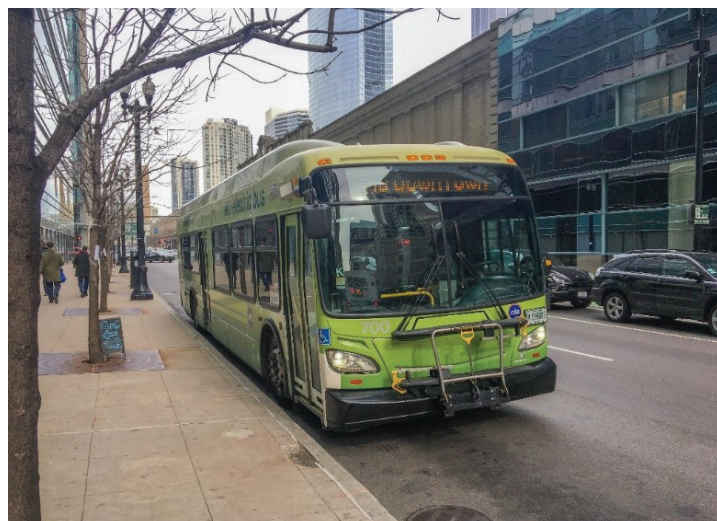
An electric bus in Chicago.

The CTA has committed to converting its entire bus fleet to electricity by 2040, 117 and has claimed that its experience with electric buses has demonstrated that these vehicles are a viable way of building a "greener, healthier and more efficient" transit system. 118