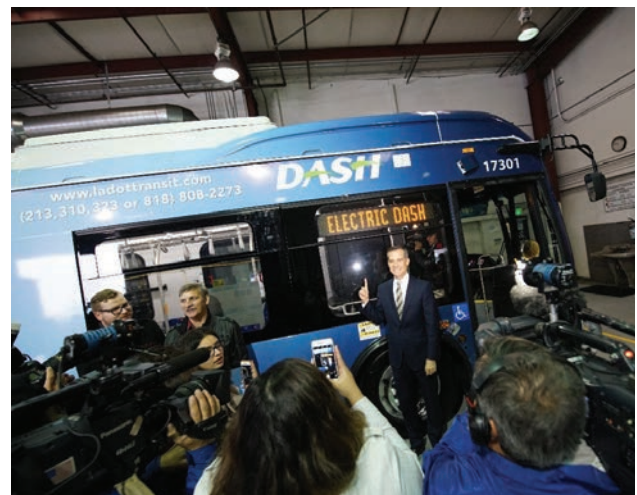
Los Angeles Mayor Eric Garcetti unveils a new 100% electric DASH bus.

California has been at the forefront of moves towards bus electrification. In 2018, the California Air Resources Board approved a statewide rule committing to shift to 100 percent all-electric transit buses by 2040. 71 Large transit agencies in the state will be required to purchase 25 percent electric buses starting in 2023, then 50 percent by 2026, with no new purchases of non-electric buses beginning in 2029. 72 In 2017 the Los Angeles Department of Transportation (LADOT) and Los Angeles County Metropolitan Transportation Authority (LA Metro) committed to full-fleet electrification by 2030. 73 As of 2019, California has 210 electric buses in service and a backlog on order, bringing its total commitment to electric buses to around 450. 74