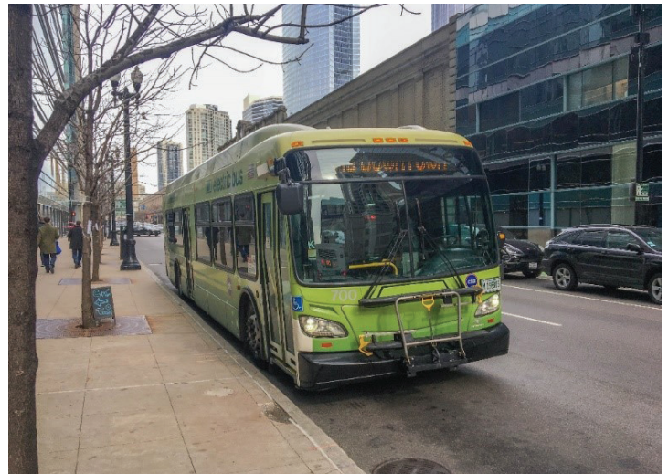
An electric bus in Chicago.

The CTA has committed to converting its entire bus fleet to electricity by 2040, 117 and has claimed that its experience with electric buses has demonstrated that these vehicles are a viable way of building a "greener, healthier and more efficient" transit system. 118