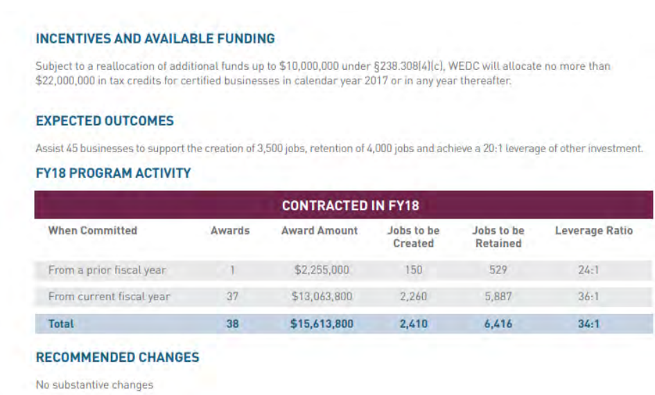
FIGURE 6. WISCONSIN'S ANNUAL GRANTS REPORT PROVIDES CLEAR FISCAL YEAR INFORMATION FOR EACH ACTIVE PROGRAM. EXAMPLE: REPORT FOR BUSINESS DEVELOPMENT TAX CREDIT 65

Unified economic development budgets present a comprehensive view of state economic development spending and forecast how much existing programs will cost in the upcoming fiscal year. These documents enable decision-makers to see how subsidies are distributed from various public agencies across regions, industries and companies. In