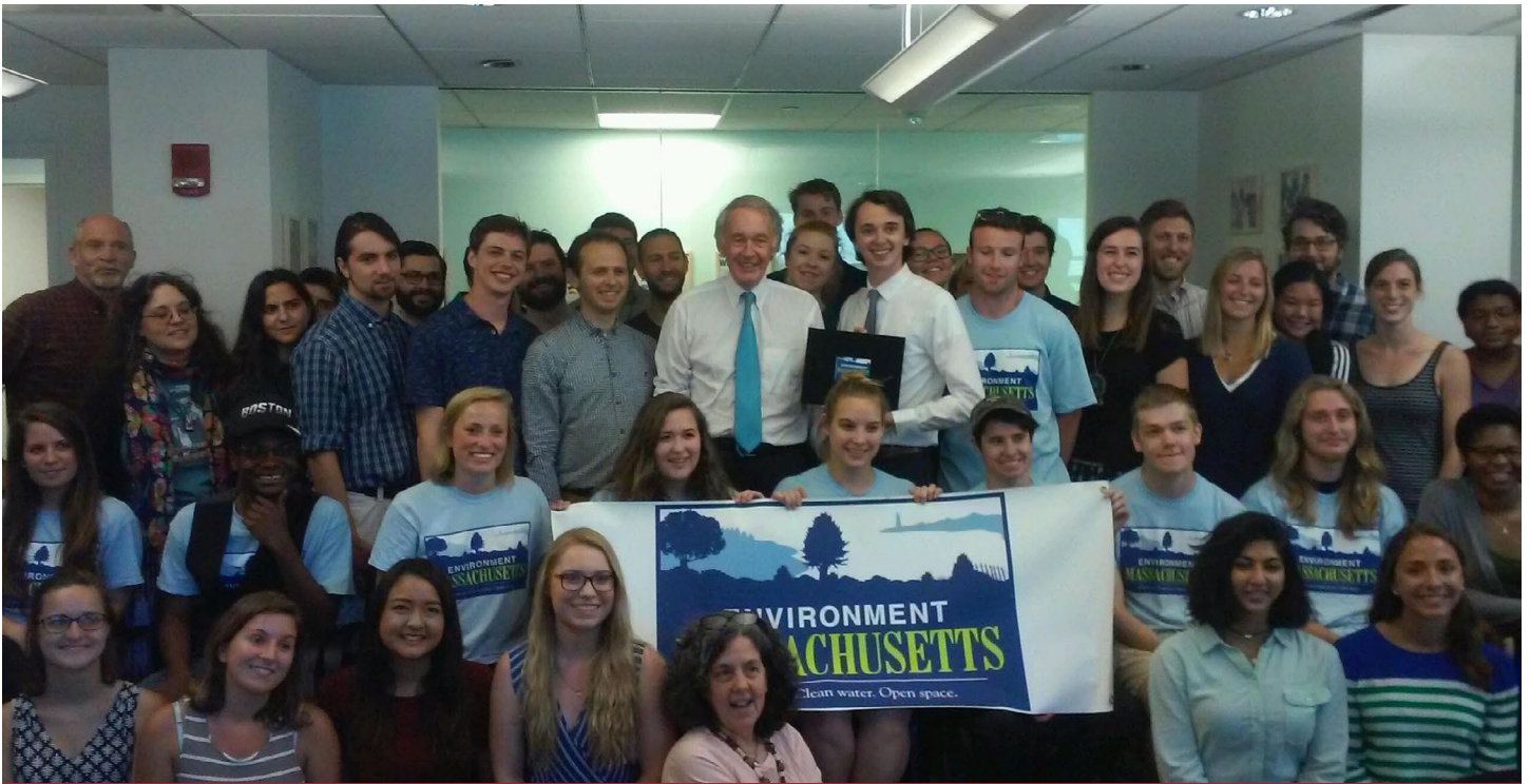
United States Senator, Ed Markey (MA), spoke to our interns and staff on the importance of getting involved in efforts to protect the environment (S '17).

In the summer of 2016, in collaboration with our Public Interest Network partner organizations, and with generous support from the Nord Family Foundation, The Paul & Edith Babson Foundation, and the Consumer Federation of America, MASSPIRG Education Fund expanded and enriched our internship program. Over the last four summers, 86 college and graduate school interns have worked on more than 30 campaigns for our network of public interest groups.