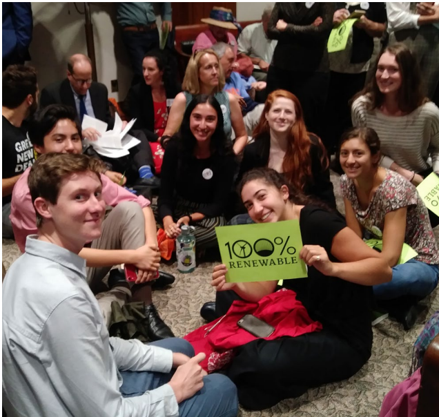
Interns supporting 100% renewable energy at a State House public hearing (S '19).