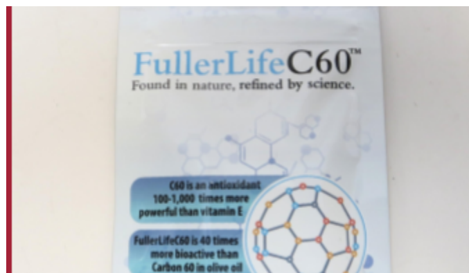
FullerLifeC60 received a warning letter for unproven claims regarding their herbal product. (Credit: FDA).

"Here is the testimony of a man who was experiencing very serious symptoms of Coronavirus...He is recovering quickly—90% improved, has just a slight remnant of cough occasionally. The rest of the family who also took MMS are now fully recovered." • "Every week I am putting in the G2Sacramental dosing for Coronavirus, why . . . we have a family on it, we have a couple of other people . . . 6 drops MMS activated 4oz of water every two hours four or five times the first day, it should, it might even kick it out the first day."