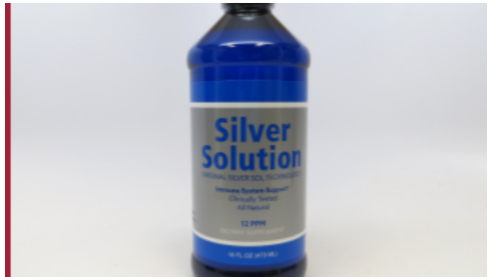
Silver Sol Liquid received a warning letter for unproven claims regarding this silver solution.

More than half (56%) of the FDA warning letters to Coronavirus products claim to have immune building, strengthening, supporting, boosting, or enhancing properties to treat or prevent Coronavirus. One fourth claim to have antiviral effects that do the same.