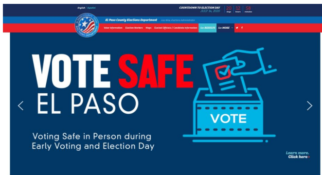
Figure 1: El Paso County Elections Department Landing Page 26