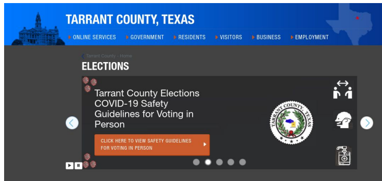
Figure 2: Tarrant County Elections Department Landing Page 27