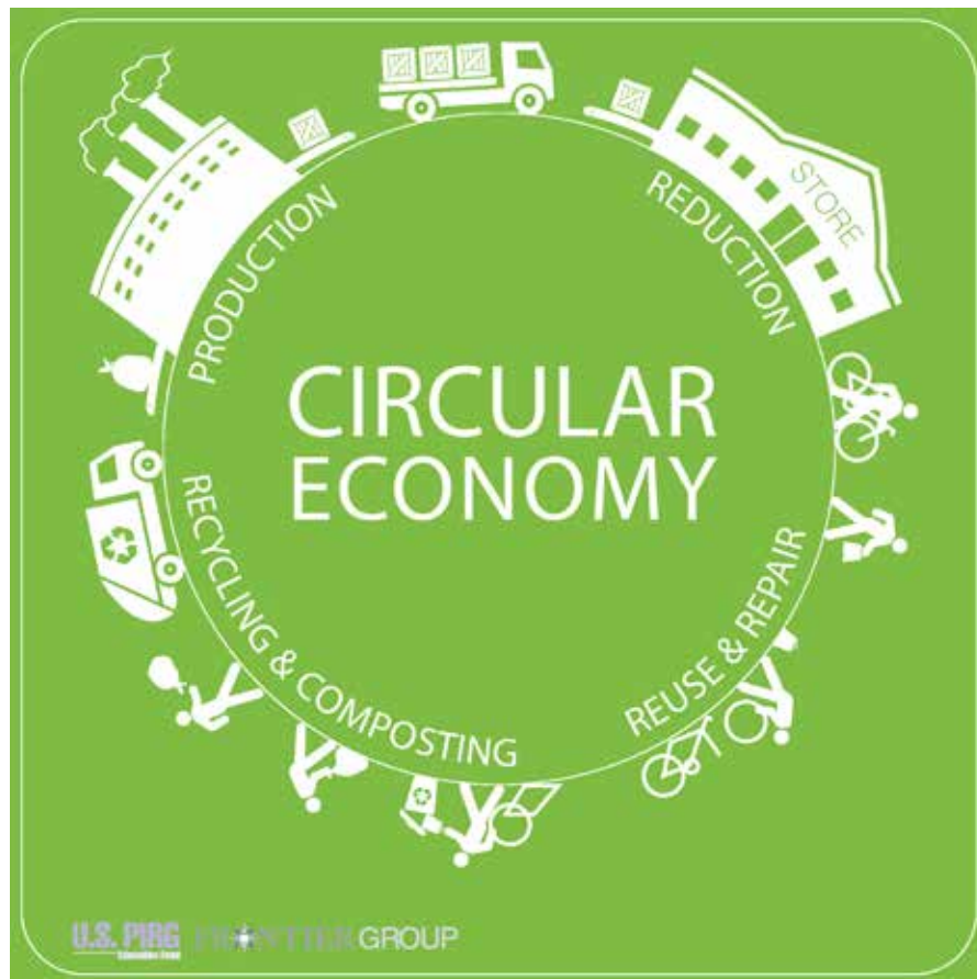
Figure 2. In a circular economy all materials are reduced, reused, repaired, recycled or composted – replacing the need for extraction, landfilling and incineration

cally collect their products at the end of their life, requiring them to pay for the collection and disposal process through fees paid to a producer responsibility organization that collects and processes materials on the producers' behalf, or a combination of both.