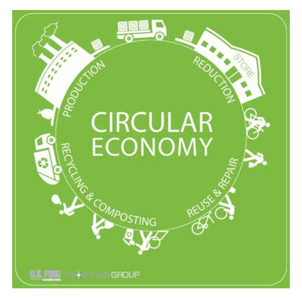
Figure 2. In a circular economy all materials are reduced, reused, repaired, recycled or composted – replacing the need for extraction, landfilling and incineration

cally collect their products at the end of their life, requiring them to pay for the collection and disposal process through fees paid to a producer responsibility organization that collects and processes materials on the producers' behalf, or a combination of both.