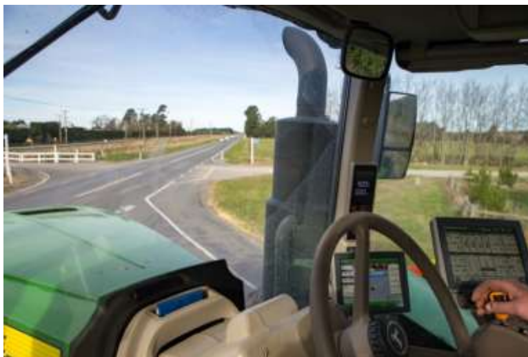
Figure 2: Farmers interact with embedded code through selectable buttons or lists on their screen.

But translating this information back into the source code originally written by the software engineers is essentially impossible. 71 That's why Apple, 72 HP 73 and others freely make embedded code available for their products in the form of firmware updates.