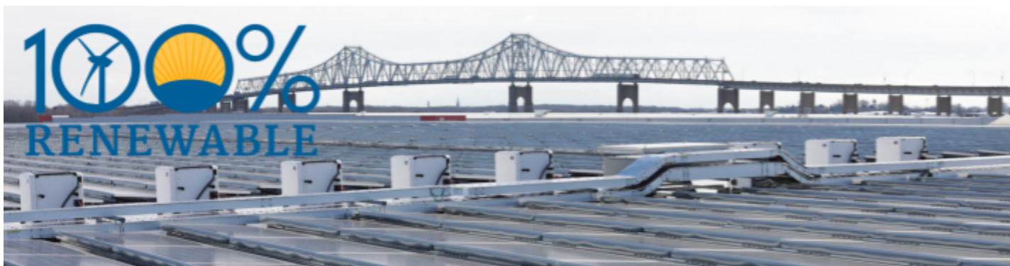
Community solar in Perth Amboy.