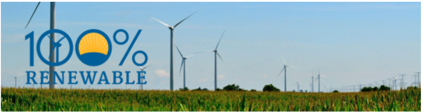
Wind turbines in Illinois.