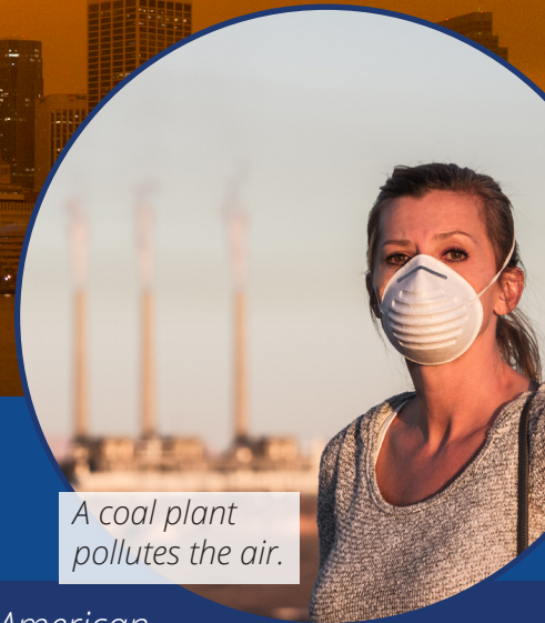
A coal plant pollutes the air.

Smoke and ash blanket San Francisco in September 2020.