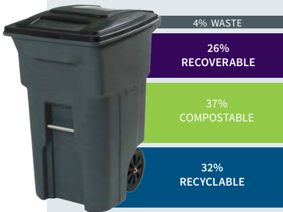
FIGURE 2. STATEWIDE DATA ON HOW MUCH OF COLORADO'S WASTE COULD BE RECOVERED vii

Recycling is a win for Colorado's economy as well as our environment. Each year Colorado throws away nearly $265 million worth of recyclable material such as aluminum, cardboard, paper, glass and plastics in our landfills. viii That material could have been recycled here in Colorado, creating local jobs and strengthening local economies. Recycling, reusing and remanufacturing already generate over $8.7 billion in economic benefits in Colorado annually, even with our low recycling rate. ix On average, recycling creates nine times more jobs per ton than landfills and reusing materials creates 30 times more jobs. x Yet most of our paper, plastics and metals are shipped out of state, or even out of the country, rather than recycled locally.