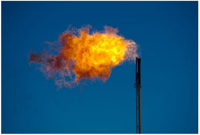
Natural gas flaring is widespread in the Permian Basin, damaging the environment and public health.

availability of pipelines, use flares that only partially burn the gas before releasing it, or directly vent uncombusted methane to the atmosphere. This is bad for the climate and public health, and is a wasteful use of Texas' fossil fuel resources.