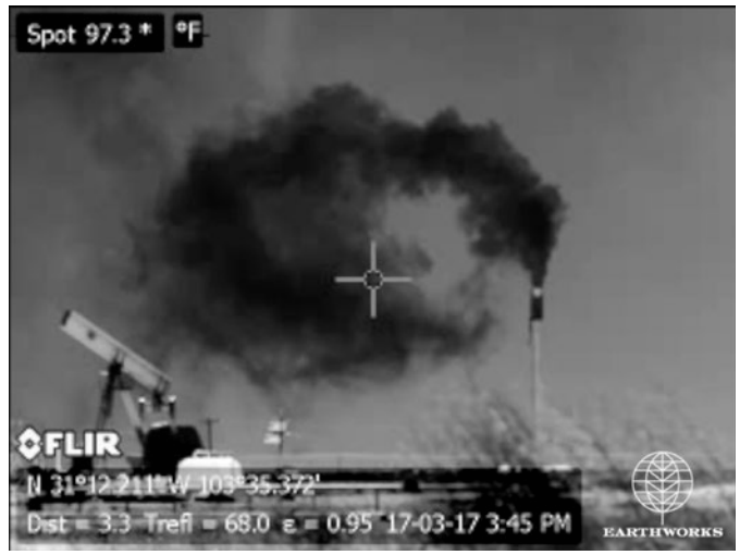
The image on the right shows methane spewing from an unlit flare, which is invisible to the naked eye, in Reeves County.

Natural gas flaring and venting is especially common in the Permian Basin. There, oil companies burned nearly 300 million cubic feet of methane in 2019.<sup>30</sup> That much gas could provide electricity to 7 million homes for a year.<sup>31</sup> Worse, many companies in the Permian Basin operate faulty flares that only partially burn natural gas and release methane directly into the atmosphere.<sup>32</sup> Surveys of flares in February and March 2020 found that more than 10 percent of flares were malfunctioning, including 5 percent of flares that were not even lit.<sup>33</sup>