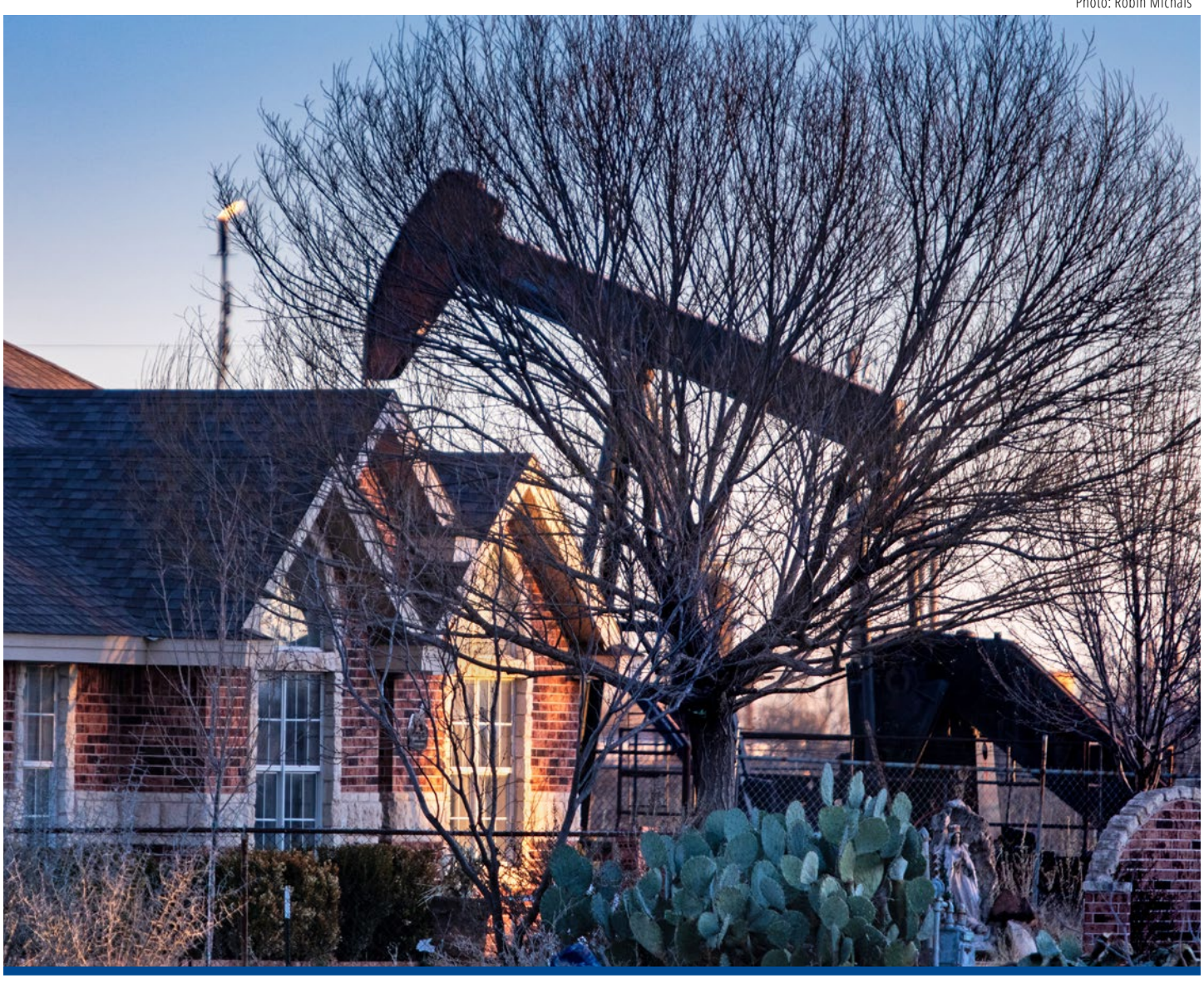
A home in West Odessa sits near a pumpjack and a flare, January 2020.

• The state legislature should eliminate the exemption of flared gas from the state's existing gas production tax. Currently, the statutory tax rate for gas that is produced and sold into the market is 7.5 percent.<sup>85</sup> Gas that is burned off through flaring is currently exempt from taxation which results in lost state revenue that would otherwise be funding schools and roads. Importantly, if oil and gas companies were required to pay a tax on flared gas, they would have a greater incentive to reduce flaring.