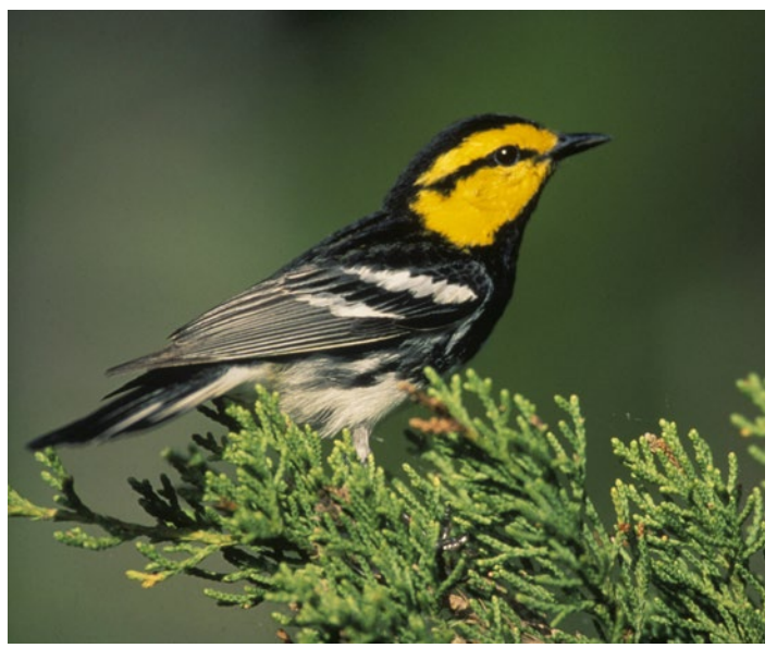
A golden-cheeked warbler.