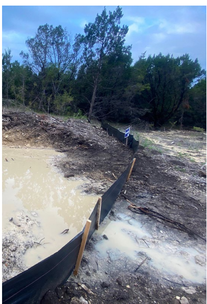
Construction of a pipeline in Central Texas' Hill Country created erosion and runoff in May 2020.

Construction of these projects would cause significant environmental damage. According to a 2020 University of Texas study, building the state's planned, under construction and recently completed projects — including refineries, petrochemical facilities, oil and liquified natural gas terminals, and other infrastructure — would result in an emissions increase of at least 179 million tons of CO<sub>2</sub> equivalent (CO<sub>2</sub>e) by 2030.<sup>72</sup> That's equal