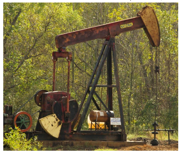
Thousands of inactive wells could require plugging by the state if the companies that own them go bankrupt.

Although Texas has more than 6,000 orphan wells, the state plugged only 1,700 wells in 2019.<sup>46</sup> In addition to orphan wells, there are more than 130,000 inactive wells in the state.<sup>47</sup> The RRC recently allowed companies to delay plugging nonproducing wells, a move that it hopes will help financially struggling companies — but could also increase the subsequent wave of orphan wells.<sup>48</sup> As oil and gas companies go bankrupt from the current crisis, thousands more wells could be orphaned and require state-funded cleanup. According to one estimate, low oil prices could cause hundreds of companies to declare bankruptcy by the end of 2021.<sup>49</sup>