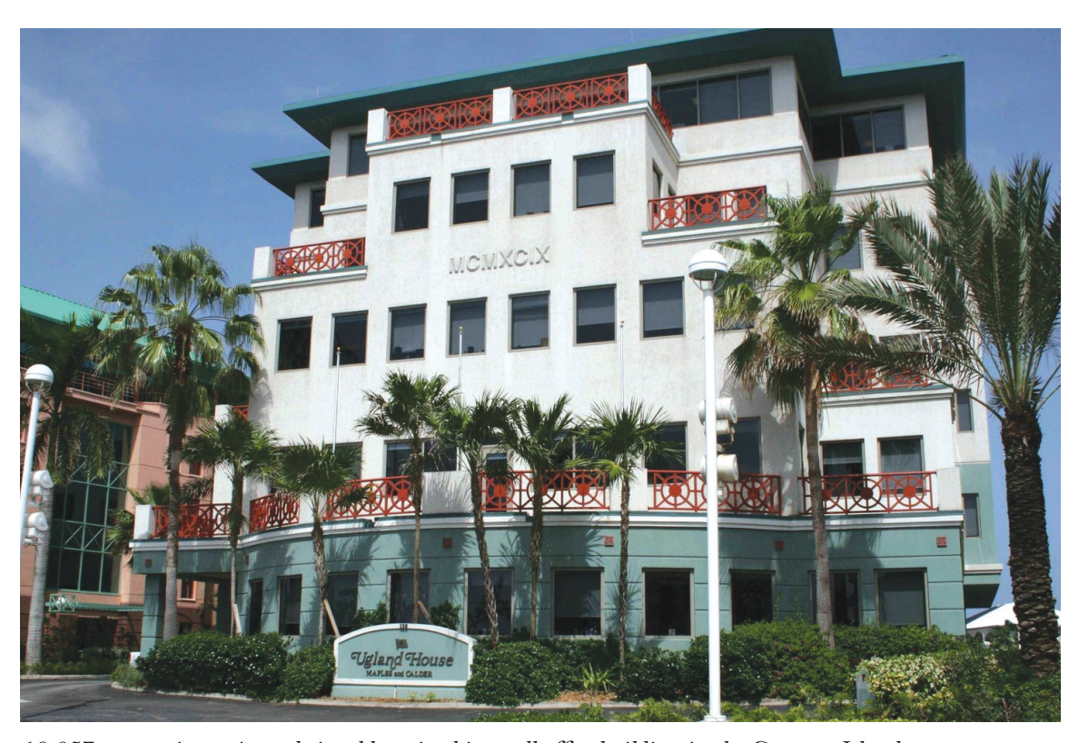
18,857 companies register their address in this small office building in the Cayman Islands.

Small business owners, along with ordinary Americans, pick up the tab either by paying higher taxes, suffering from cuts to public programs, or facing a larger national debt. And without access to offshore subsidiaries, small businesses and medium-sized domestic businesses are put at an unfair competitive disadvantage and forced to compete on an uneven playing field.