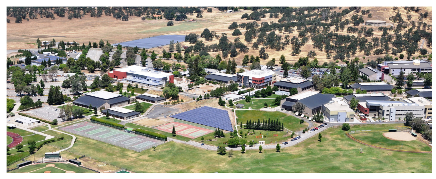
With the installation of more than 25,000 solar panels, Butte College became the nation's first college campus to become "grid positive," meaning that the college was able to generate more electricity than it uszed.

Butte College is a community college located on a beautiful campus of open spaces and grassy hills about 130 miles northeast of San Francisco. When the school was being developed in the early 1970s, its campus was designated a wildlife refuge to protect the wide variety of habitats and wildlife located there.