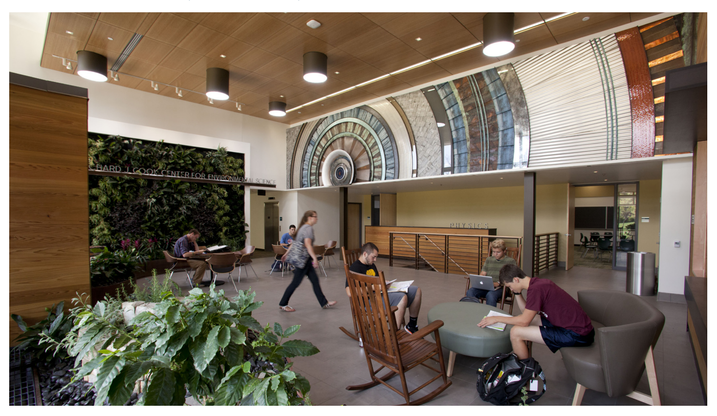
Allegheny College's renovation of Carr Hall made the building 23 percent more efficient through improvements such as better heat recovery and energy-efficient lighting.

America has vast potential to do more with less energy. Eliminating waste saves money, making energy efficiency measures the cheapest way to meet many energy needs. Many energy efficiency solutions are available today and can be deployed quickly. For these reasons, experts often call efficiency the "first resource."