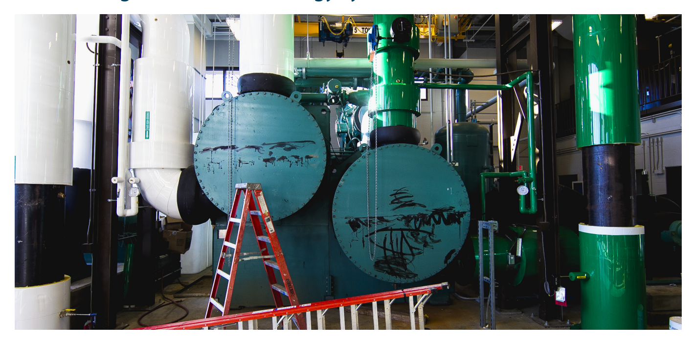
Ball State replaced coal-fired boilers with one of the nation's largest geothermal energy systems, which today provides heating and cooling to more than 5 million square feet of space in 47 buildings.

Heating a large college campus requires a large amount of energy, which typically involves burning polluting fossil fuels.