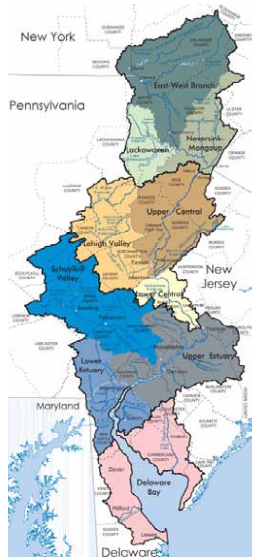
Figure 1. The Delaware River Basin Spans Four States and Supplies Water to More Than 15 Million People 14

The beauty and importance of the Delaware have not kept polluters along its banks from fouling the river in ways that harm wildlife and human health. For centuries, waterways in the Delaware River Basin were severely polluted. 17 The first survey of pollution in the river, conducted in 1799, recognized that tanneries, slaughterhouses and harbor areas were sources of pollution that caused disease, like typhoid outbreaks in the 1860s. 18 Intense development and use of the river system, population growth and industrial expansion all further contributed to pollution, leading to the collapse of the historic shad fishery, among others. 19