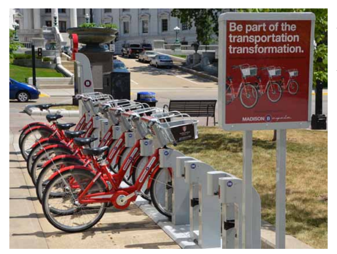
UW-Madison provides students with discounted membership in the city's bikeshare program, B-cycle.

enthusiasts, UW-Madison has made cycling a particularly popular option for students. In good weather, 22 percent of students travel to campus by bike, a figure that has risen in recent years, making biking to class the second most popular choice after walking.<sup>56</sup> After a decline in the late 1990s and early 2000s, the share of students biking to campus has climbed eight percentage points since 2006.<sup>57</sup> All told, about 12,000 people bike to campus each day in Madison and just 6.5 percent of students drive alone.58