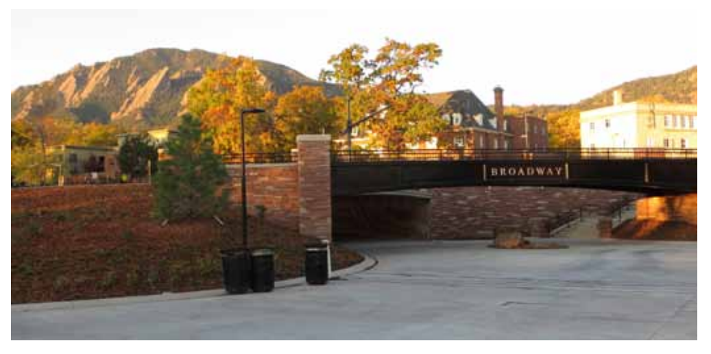
Pedestrian and bicycle underpass at Broadway bordering the CU-Boulder campus.

enough for roughly one-third of students to ride to school.<sup>71</sup> Coupled with the university's investments in city underpasses, these infrastructural improvements provide both the connections to the surrounding city and the campus capacity to support the widespread use of bicycles as a means of getting around. In 2012 approximately 60 percent of all trips made by students at CU-Boulder were by bike or foot, a nearly nine percentage point increase over 1990.<sup>72</sup>