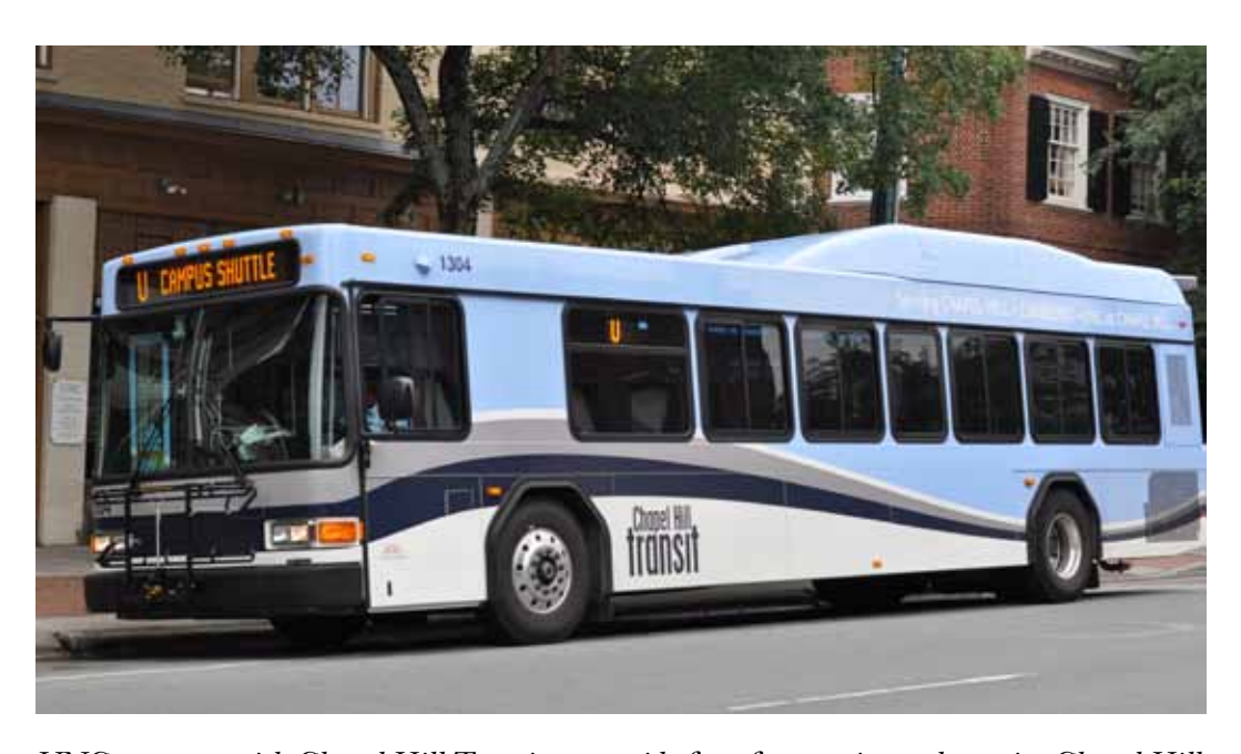
UNC partners with Chapel Hill Transit to provide fare-free service to the entire Chapel Hill community.

The university's decision to facilitate fare-free transit has also benefited the entire Chapel Hill community. Between 2001 and 2011 (the most recent year for which data are available), ridership on the local bus system surged