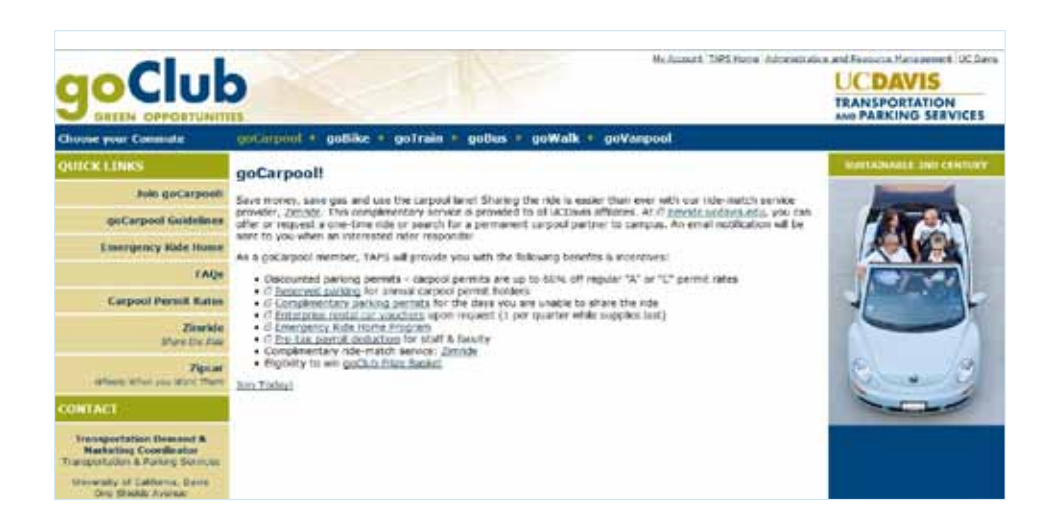
UC-Davis promotes its carpool program online.