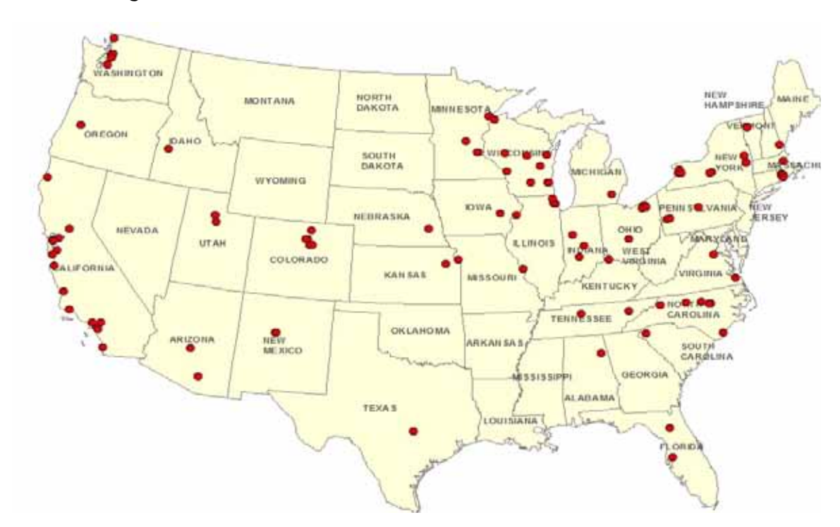
Figure 1. Colleges and Universities with U-Pass, Transit Discount or Fare-Free Transit Programs in the Conterminous United States<sup>21</sup>

Other colleges and universities augment local transit service by providing private, university-run shuttle buses. A