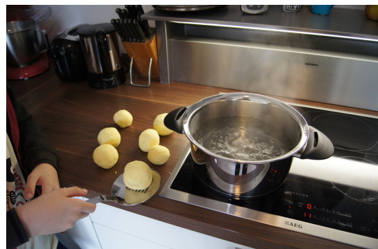
Sebastian Wallroth (CC BY-SA 3.0)