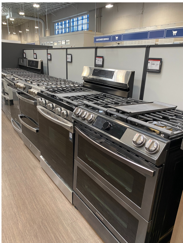
Gas Stoves on display at a Lowe's in Maryland

Retailers that sell cooking appliances should take on the responsibility of educating consumers, not only because it's the right thing to do, but because it's good business. By promoting the healthy air benefits of induction and electric options, and by ensuring that staff are well-versed and able to talk about the risks, and the need for ventilation, when using gas, retailers can help protect their customers from health-harming pollution.