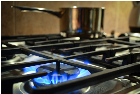
Oregon State University (CC BY-SA 2.0)