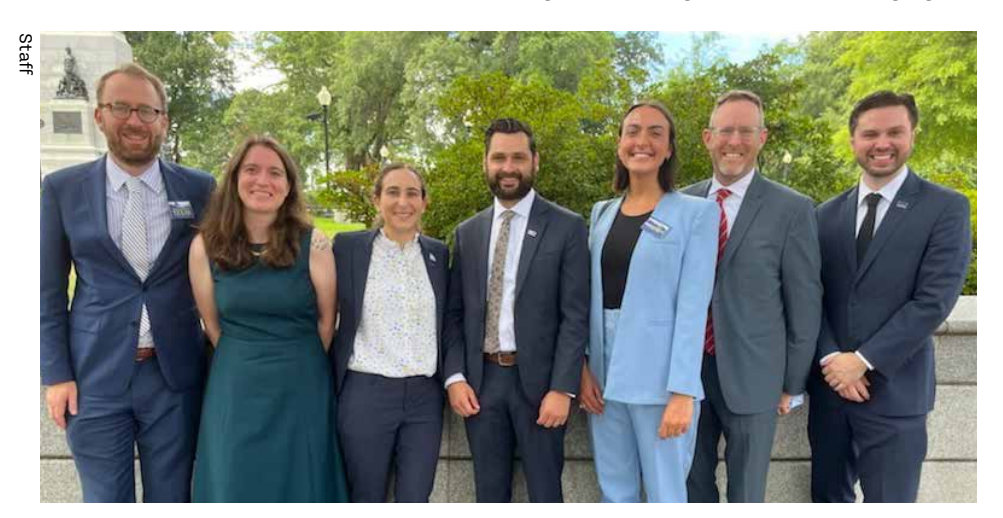
Our staff on the grounds of the White House in September for a celebration event marking the passage of the Inflation Reduction Act.

Get more updates on our work online at http://environmentnewjersey.org.