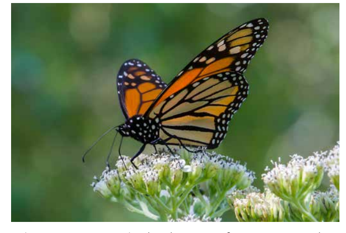
In just 40 years, America has lost 80% of eastern monarch butterflies, and more than 95% of western monarchs (pictured above).

And when they meet up with some western monarchs on their way to their winter homes, they put their differences aside and form "roosts." These roosts, or clusters of monarchs, stick togeth-