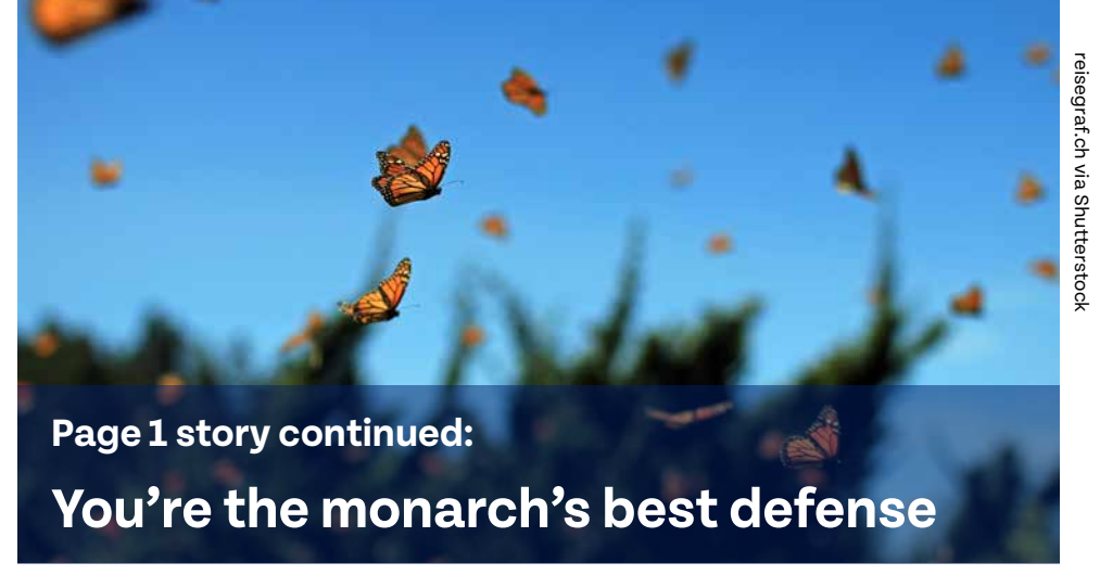
Decades ago, millions of western monarch butterflies graced our skies. Today, fewer than 250,000 remain.

Despite their differences, these butterflies have a lot in common. They both rely on the milkweed plant for food as caterpillars. Their bright orange wings are their natural defense mechanism, serving as a warning to would-be predators that they're poisonous. But even with their defenses, both are fluttering toward extinction.