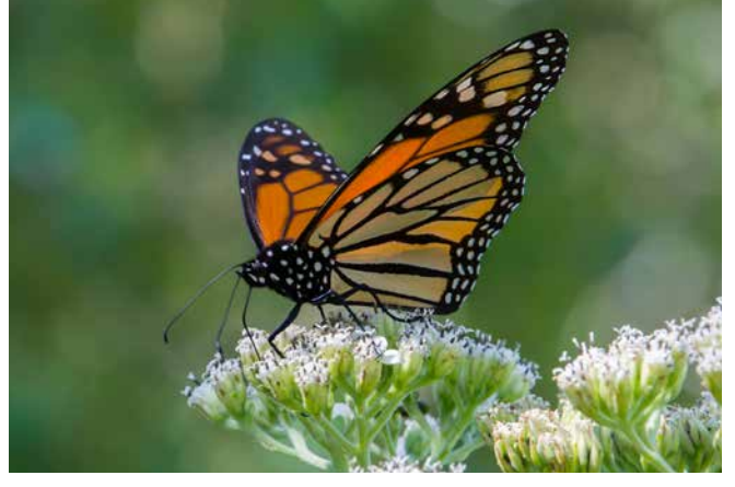
In just 40 years, America has lost 80% of eastern monarch butterflies, and more than 95% of western monarchs (pictured above).

And when they meet up with some western monarchs on their way to their winter homes, they put their differences aside and form "roosts." These roosts, or clusters of monarchs, stick togeth-