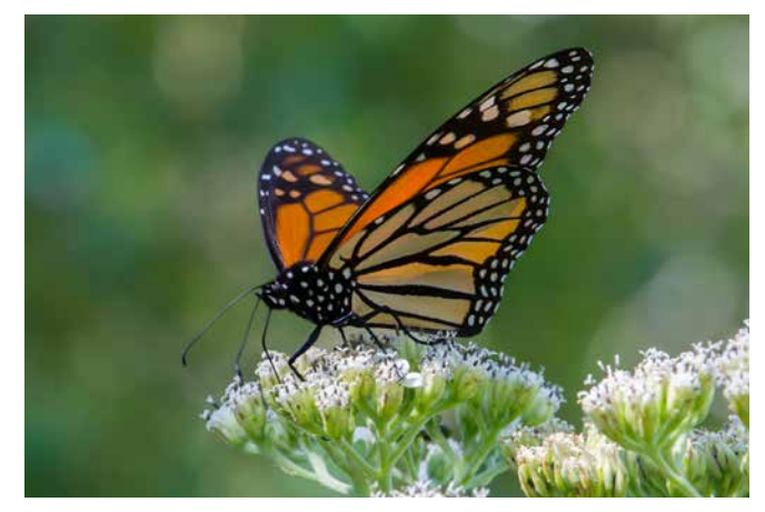
In just 40 years, America has lost 80% of eastern monarch butterflies, and more than 95% of western monarchs (pictured above).

And when they meet up with some western monarchs on their way to their winter homes, they put their differences aside and form "roosts." These roosts, or clusters of monarchs, stick togeth-