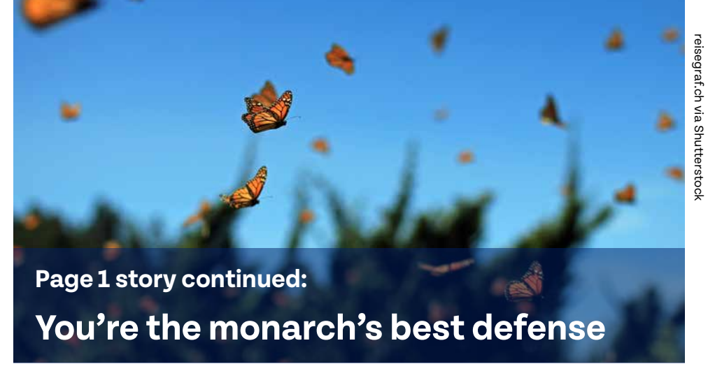
Decades ago, millions of western monarch butterflies graced our skies. Today, fewer than 250,000 remain.

Despite their differences, these butterflies have a lot in common. They both rely on the milkweed plant for food as caterpillars. Their bright orange wings are their natural defense mechanism, serving as a warning to would-be predators that they're poisonous. But even with their defenses, both are fluttering toward extinction.