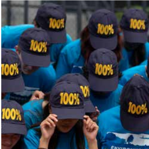
Liam Louis, ElleVignette Photography

Environment Georgia has long worked with local leaders to win strong commitments to 100% clean energy. After winning victories in seven cities, we turned our focus to Columbus in 2023, where we presented a 100% clean energy resolution to the City Council. Now, we're working to win a bold commitment.