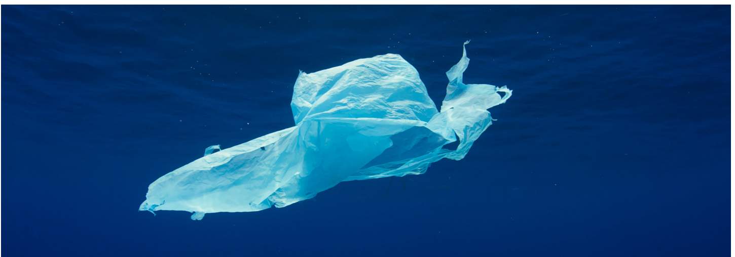
A plastic bag floating in the water.

Specific data for single-use plastic bags are unavailable, but based on U.S. Environmental Protection Agency (EPA) solid waste data, almost three-quarters of the plastic bags and wraps disposed of by Americans are landfilled. 35