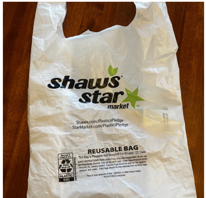
Thicker “reusable” plastic bags like these are being distributed in California and many other jurisdictions with single-use plastic bag bans.

Similarly, California’s ban on thin single-use plastic bags, which went into effect in November 2016, also allowed thicker “reusable” plastic bags to be sold for a 10-cent fee. 87 Despite this loophole, the ban reduced plastic bag