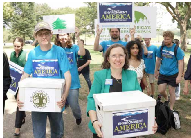
Last summer, staff delivered more than 500,000 comments urging the U.S. Forest Service to protect old-growth forests.

The draft proposal sets ambitious goals for managing and expanding old growth in national forests, but contains major gaps. Notably, it carves out the Tongass National Forest—our largest