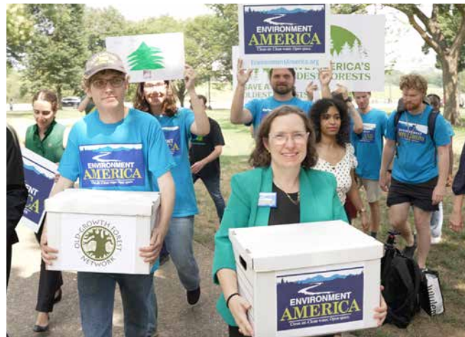
Last summer, staff delivered more than 500,000 comments urging the U.S. Forest Service to protect old-growth forests.

The draft proposal sets ambitious goals for managing and expanding old growth in national forests, but contains major gaps. Notably, it carves out the Tongass National Forest—our largest