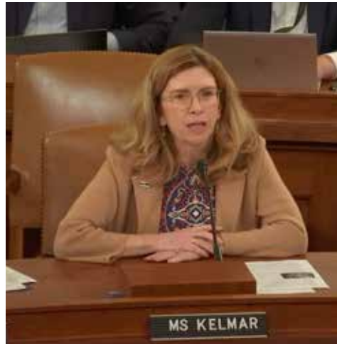
Wags and Means Committee Republicans