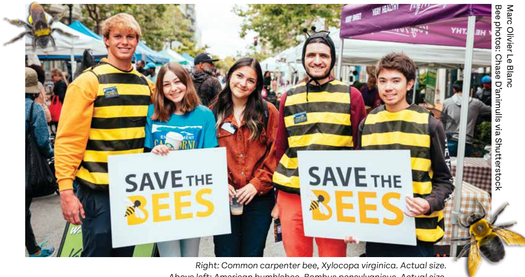
Right: Common carpenter bee, Xylocopa virginica . Actual size. Above left: American bumblebee, Bombus pensylvanicus . Actual size.

For years, our staff and volunteers have been building support to save the bees. Now, 1 in 4 Americans live in a state that has restricted the use of bee-killing neonicotinoids.