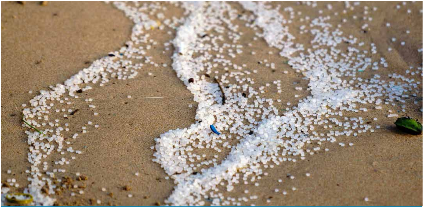
Ten trillion pellets are estimated to enter the ocean each year, making them the second-largest source of marine microplastic.