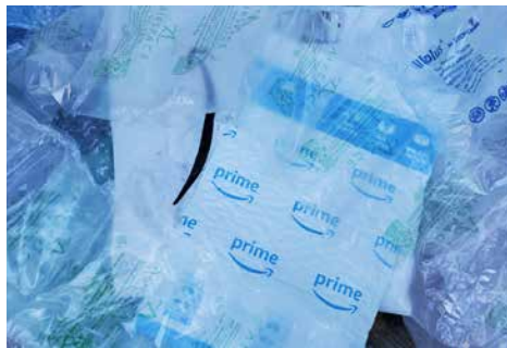
Say good night, plastic air pillows.

Amazon is headed in the right direction, but there’s still more the retail gi-