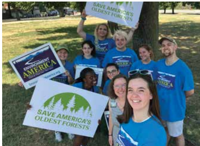
Our national canvass team, ready and excited to kick off their summer outreach campaign.

During the comment period, canvassers with Environment America's state offices knocked on doors across the country including in Oregon, Wisconsin and North Carolina where old growth forests are on the chopping block.