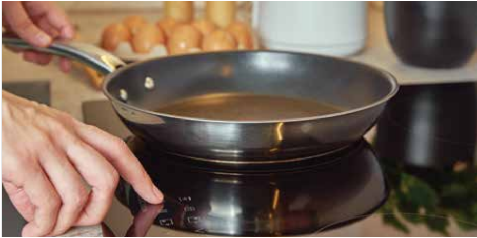
The new home energy rebate program in New Mexico covers appliances like induction stoves.

Effective immediately, low-income single-family households may receive up to $1,600 off do-it-yourself insulation products with participating retailers. New Mexico's Home Electrification and Appliance Rebates (HEAR) program will expand to provide low-income single-family homeowners and low- and middle-income renters up to $14,000 in rebates on eligible equipment and appliances—including heat pumps for space heating and cooling, heat pump water heaters, heat pump clothes dryers and induction cook stoves.