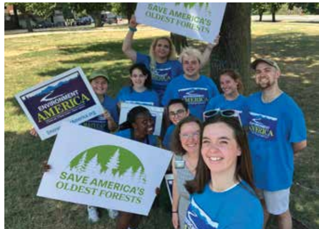
Our national canvass team, ready and excited to kick off their summer outreach campaign.

During the comment period, canvassers with Environment America's state offices knocked on doors across the country including in Oregon, Wisconsin and North Carolina where old growth forests are on the chopping block.